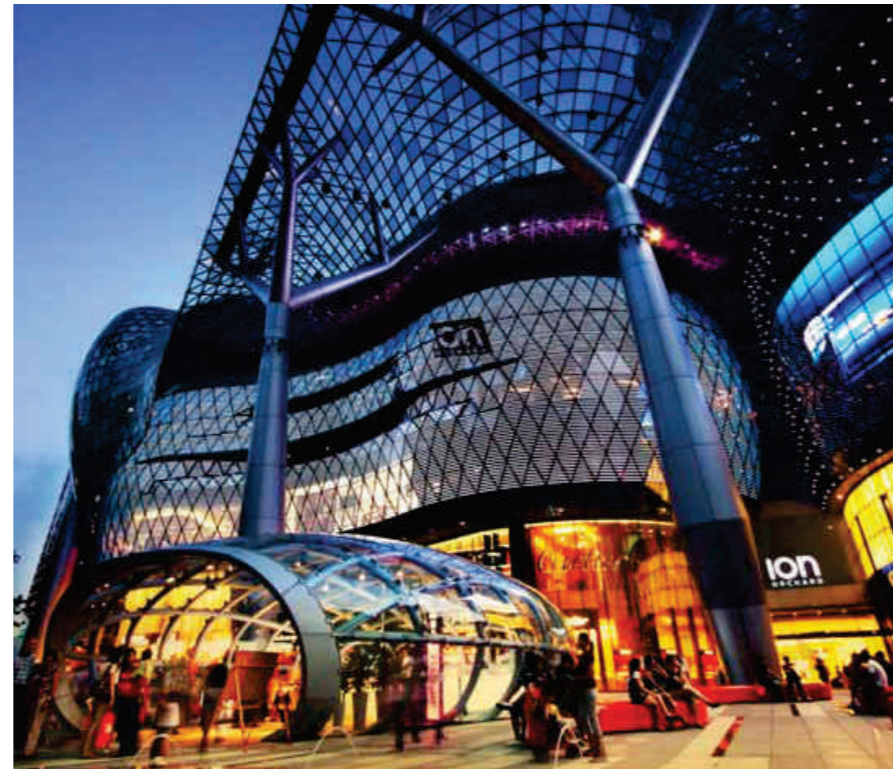
Ion Orchard, Singapore