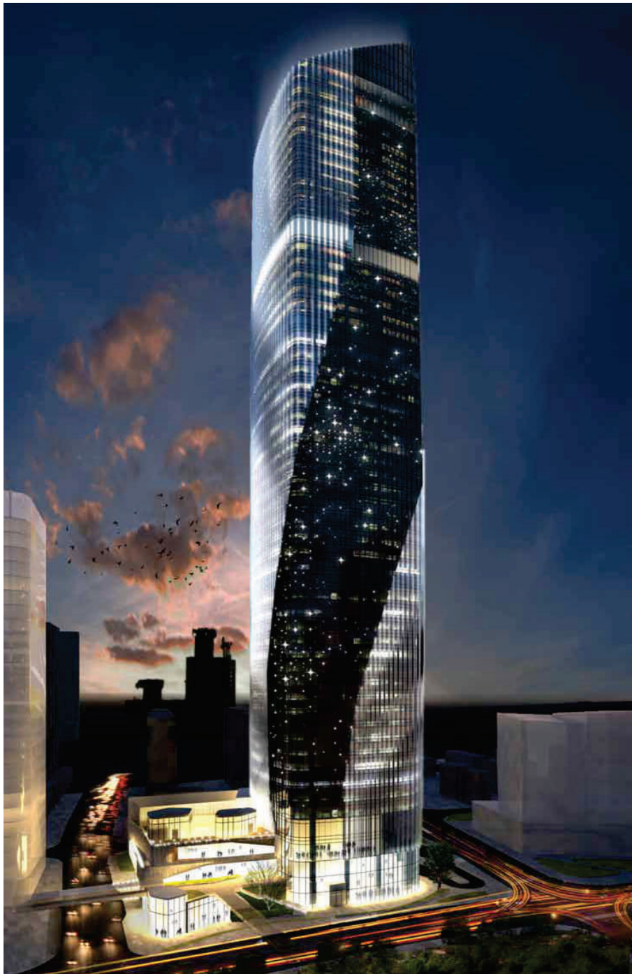
Ningbo New World, Ningbo, China