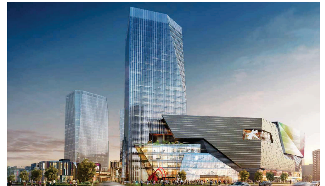
Joy City, Hangzhou, China