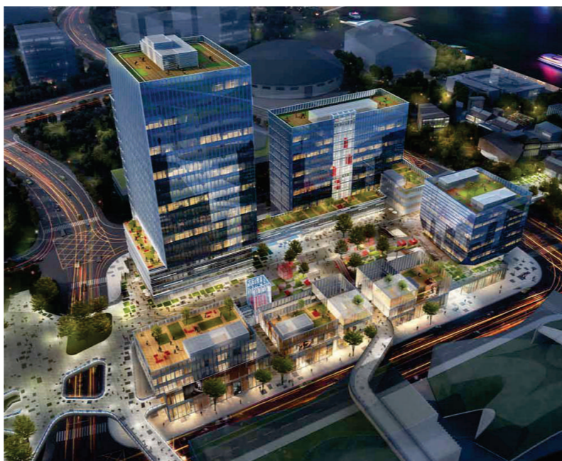
Mango West Bund Plaza, China

Creating sustainable and healthy workplaces is at the forefront of Benoy's thinking. The Team investigates not only the performance of the development but also the well-being of the end user.