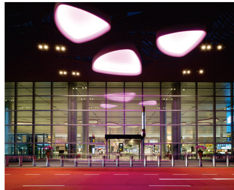
Changi Airport, Singapore