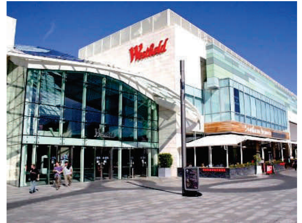
Westfield Mall, London