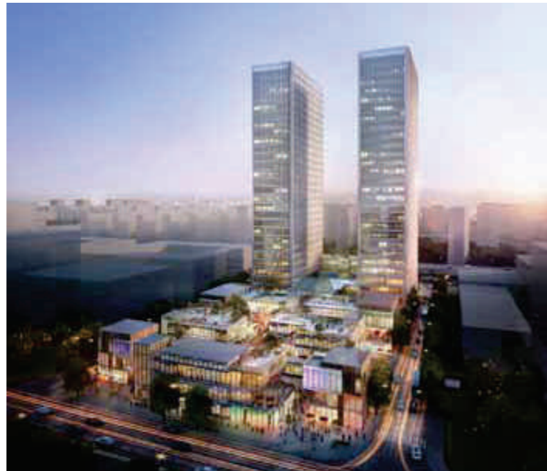
Qian Tan Office Park, Shanghai, China