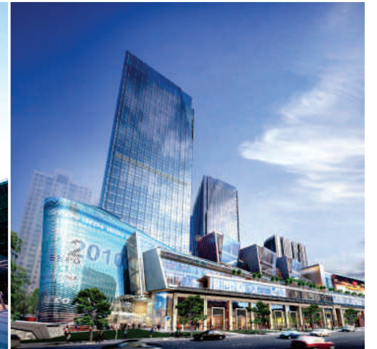
Shanghai ICC, Shanghai, China