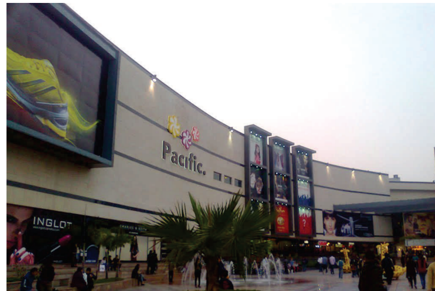
Pacific Mall, New Delhi, India