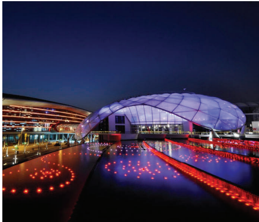
Ferrari World, Abu Dhabi, UAE