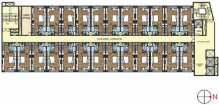
TYPICAL FLOOR PLAN STUDIO APARTMENT 672 SQ.FT. SUPER AREA