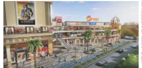
INDICATIVE ARTISTIC IMPRESSION OF MAIN PLAZA