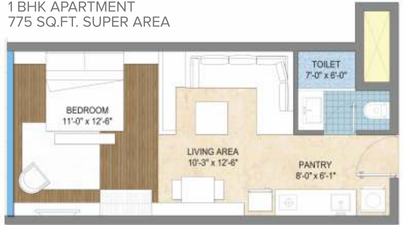
TYPICAL UNIT PLAN 1 BHK APARTMENT 775 SQ.FT. SUPER AREA