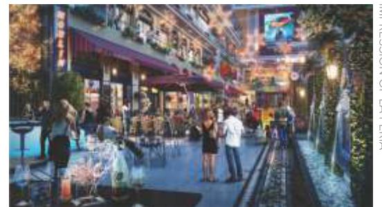
INDICATIVE ARTISTIC IMPRESSION OF LA PERLA