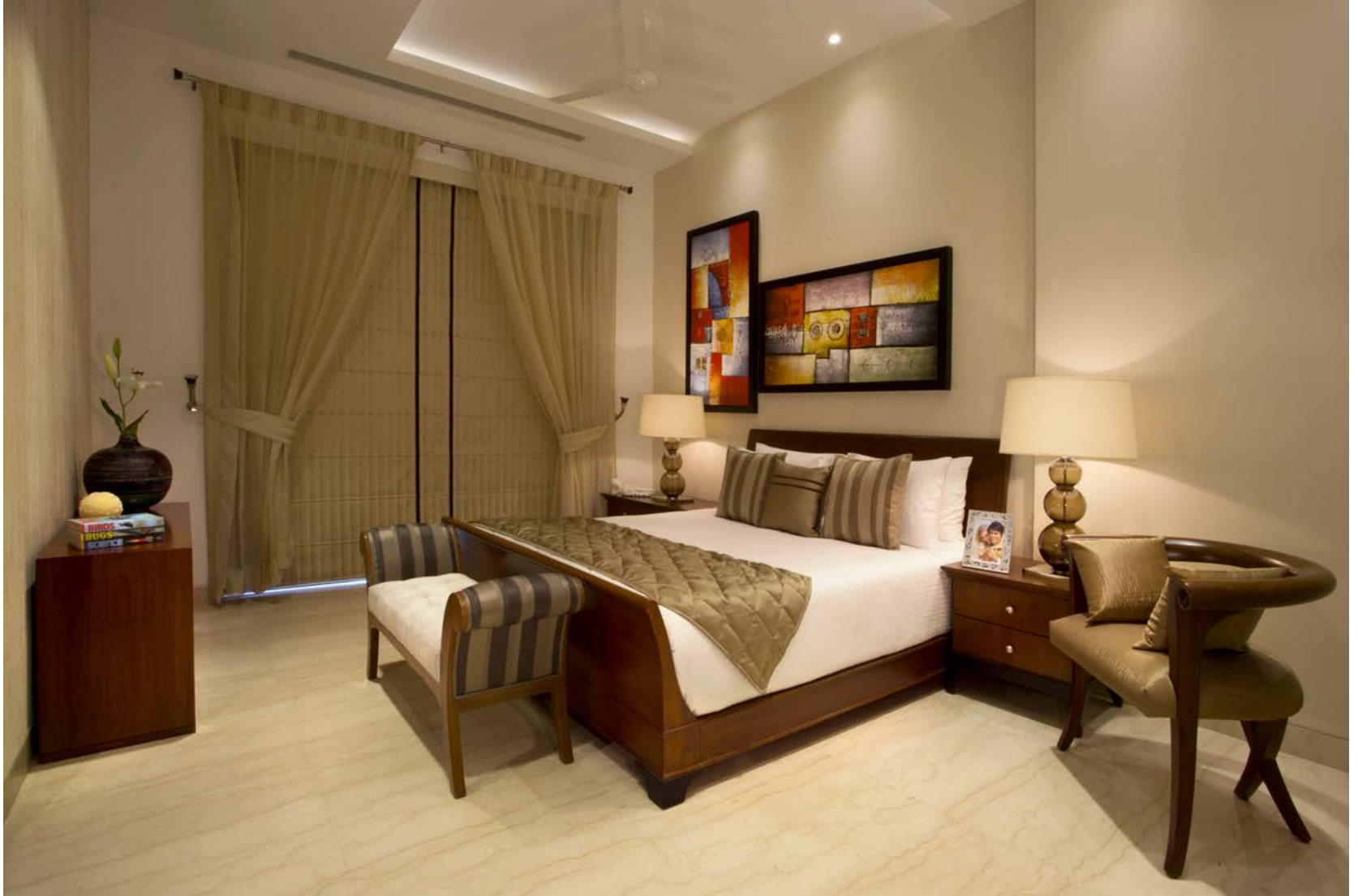
Actual sample flat image