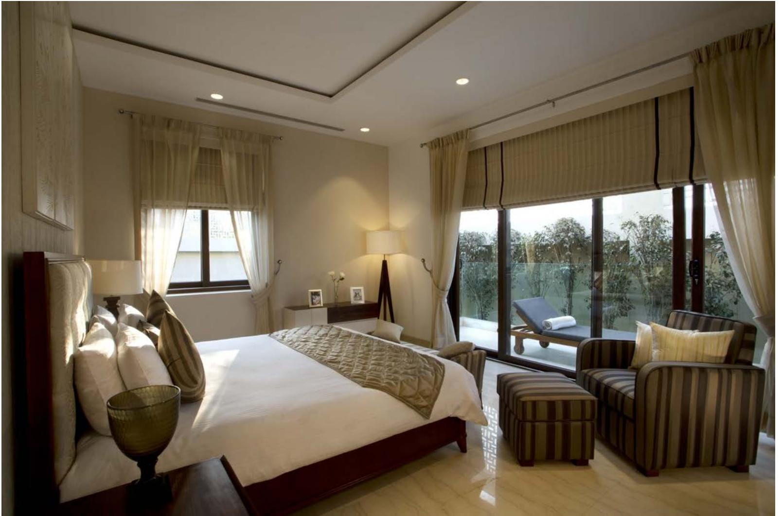
Actual sample flat image