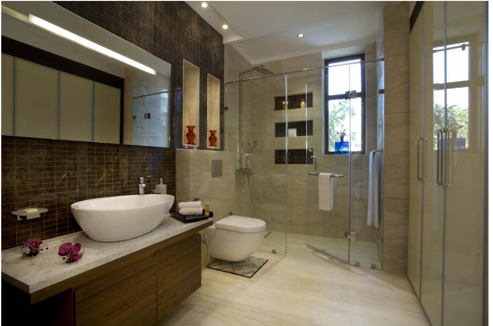
Actual sample flat image