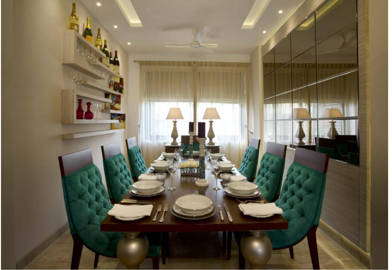
Actual sample flat image