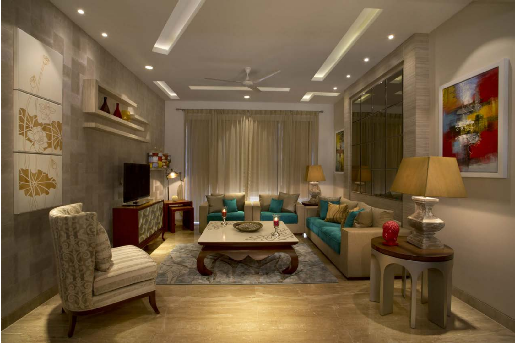
Actual sample flat image