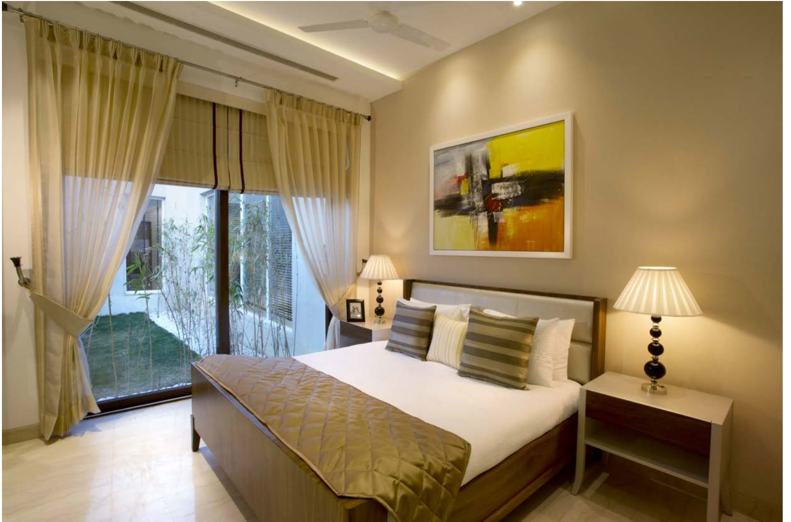
Actual sample flat image