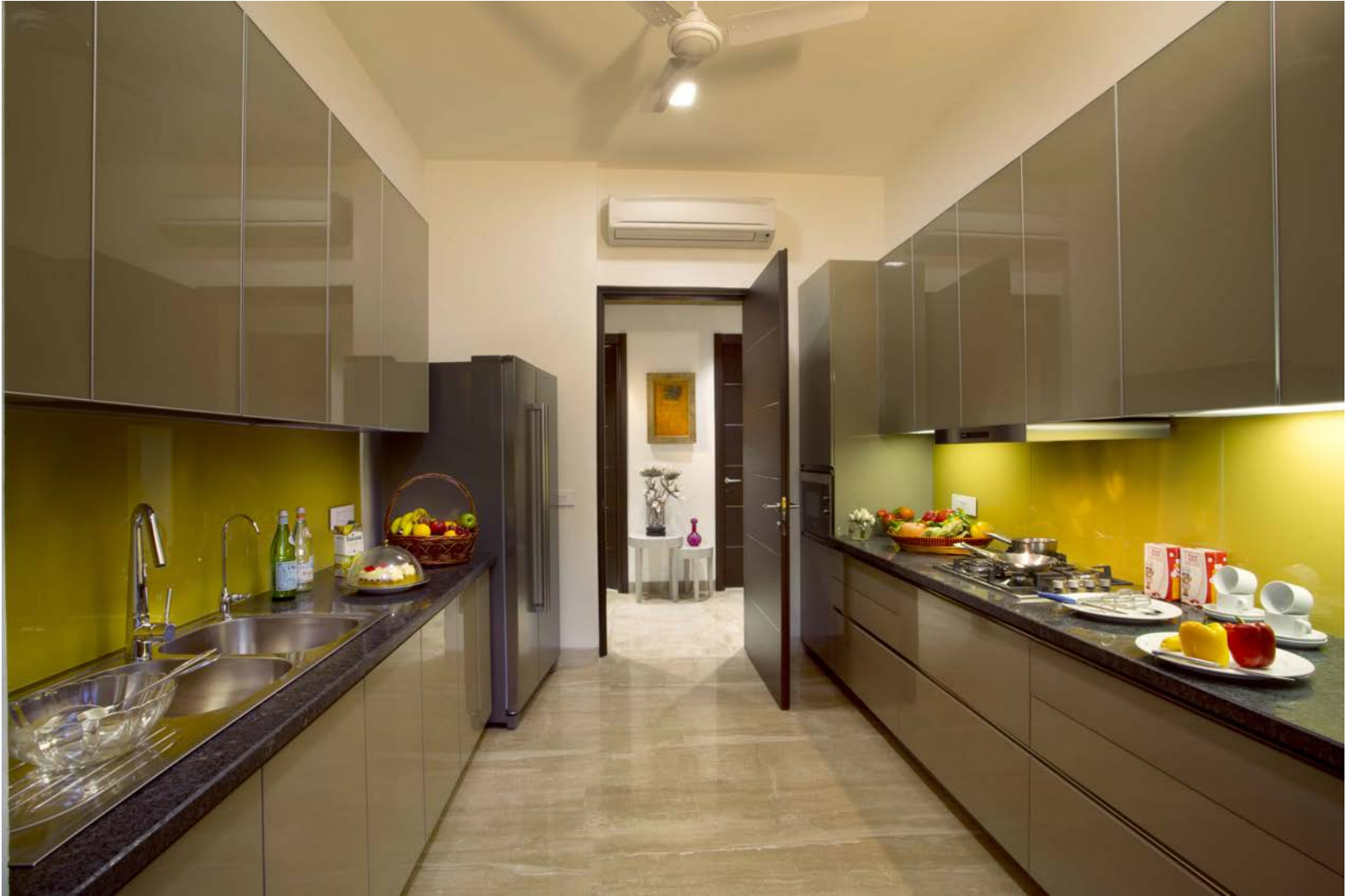
Actual sample flat image