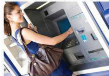
ATM / BANK FACILITIES