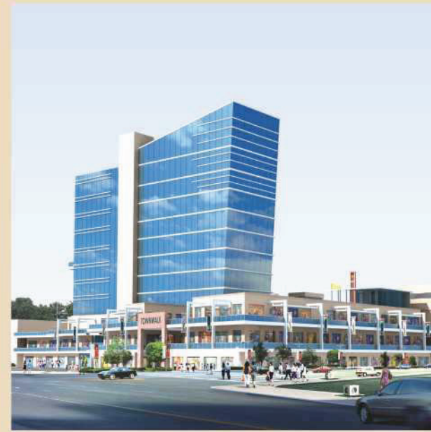
ANSALS TOWN WALK