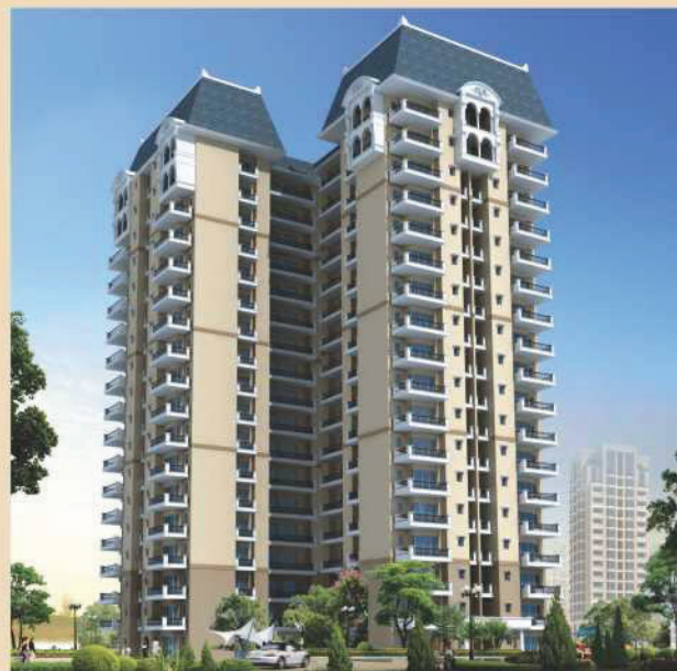
ANSALS HIGHLAND PARK