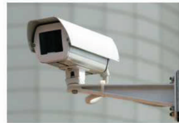
24 X 7 SECURITY