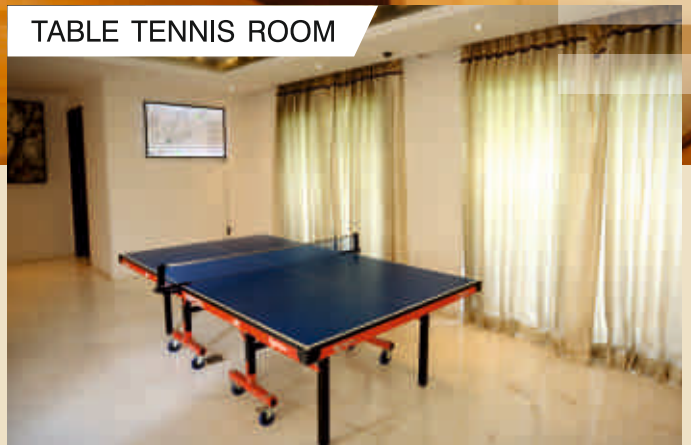
TABLE TENNIS ROOM