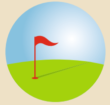
GOLF PUTTING GREENS