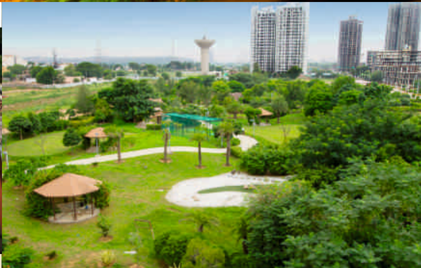
PARK ARIAL VIEW