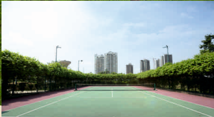
PARK ARIAL VIEW