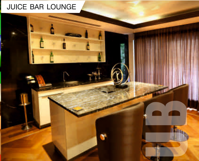
JUICE BAR LOUNGE