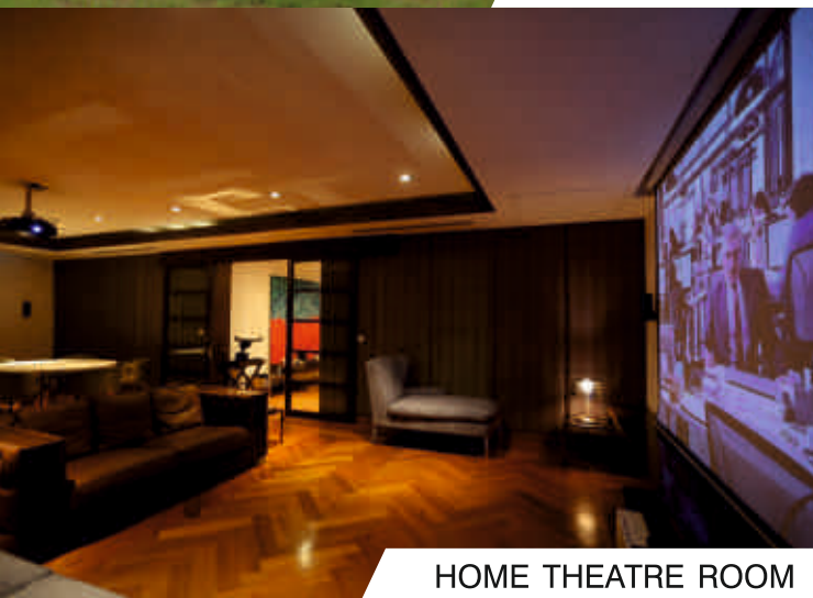
HOME THEATRE ROOM