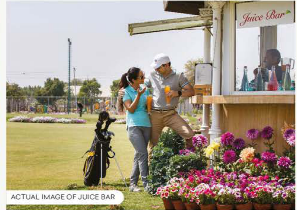
ACTUAL IMAGE OF JUICE BAR