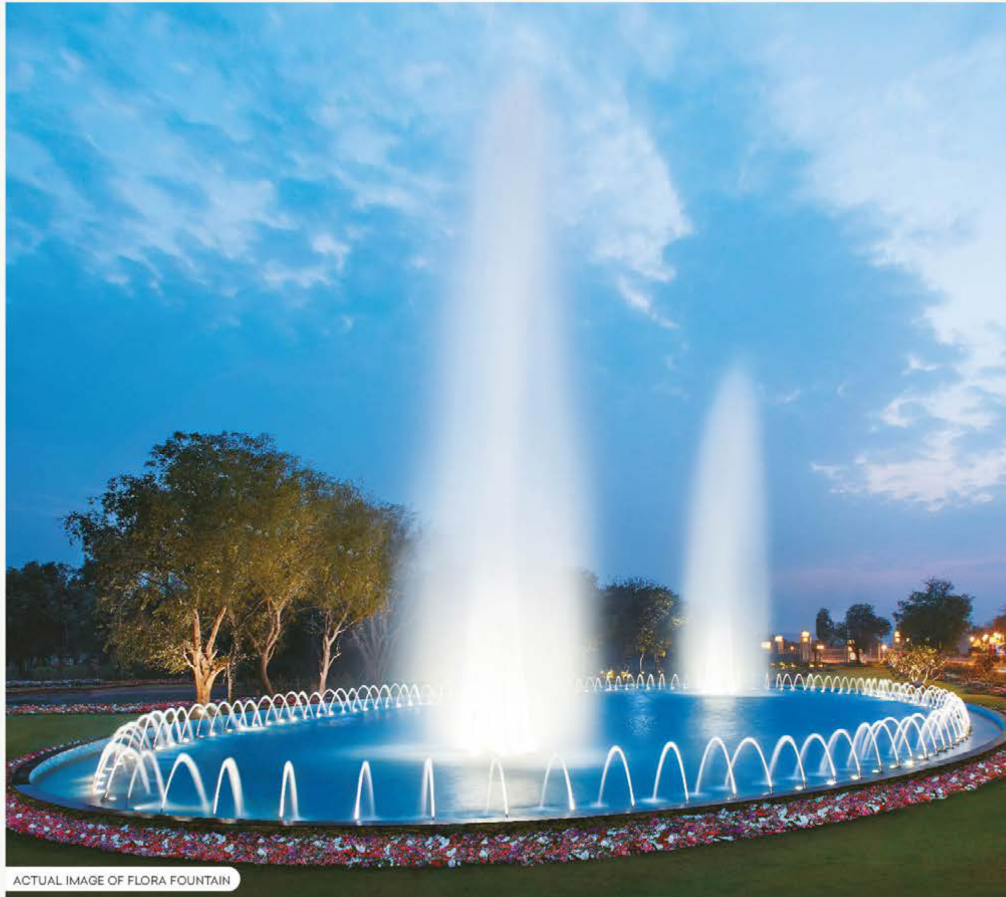
ACTUAL IMAGE OF FLORA FOUNTAIN