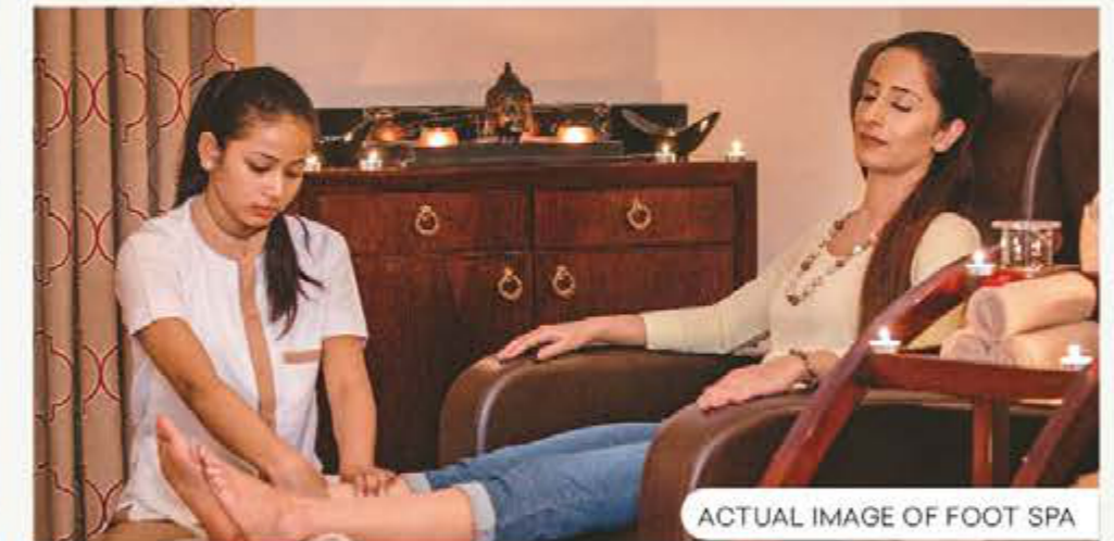
ACTUAL IMAGE OF FOOT SPA