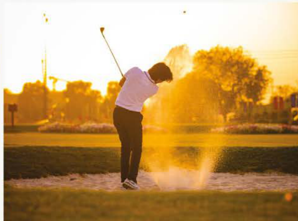
ACTUAL IMAGES OF DAY & NIGHT GOLF ACADEMY