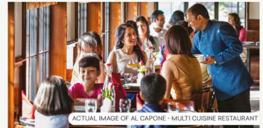
ACTUAL IMAGE OF AL CAPONE - MULTI CUISINE RESTAURANT