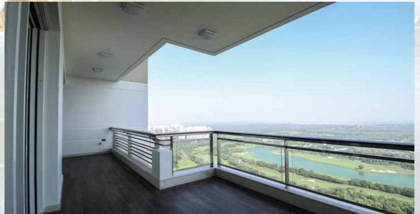
MASTER BEDROOM DECK