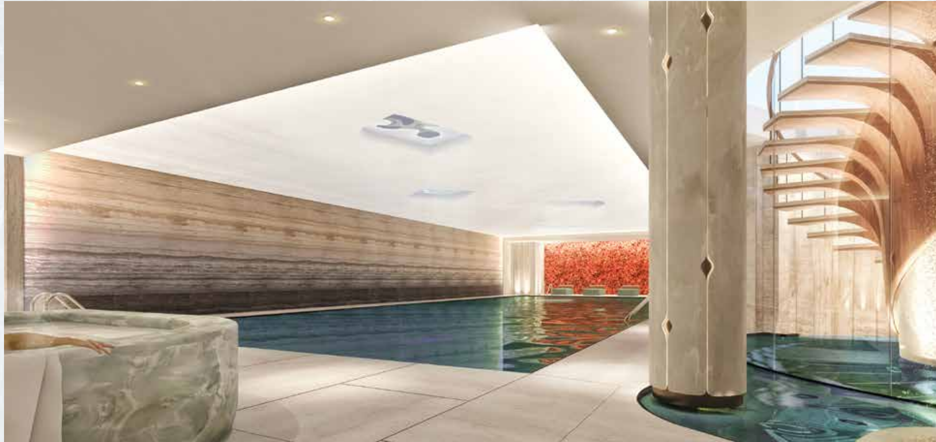
ARTISTIC RENDITION OF THE INDOOR SWIMMING POOL