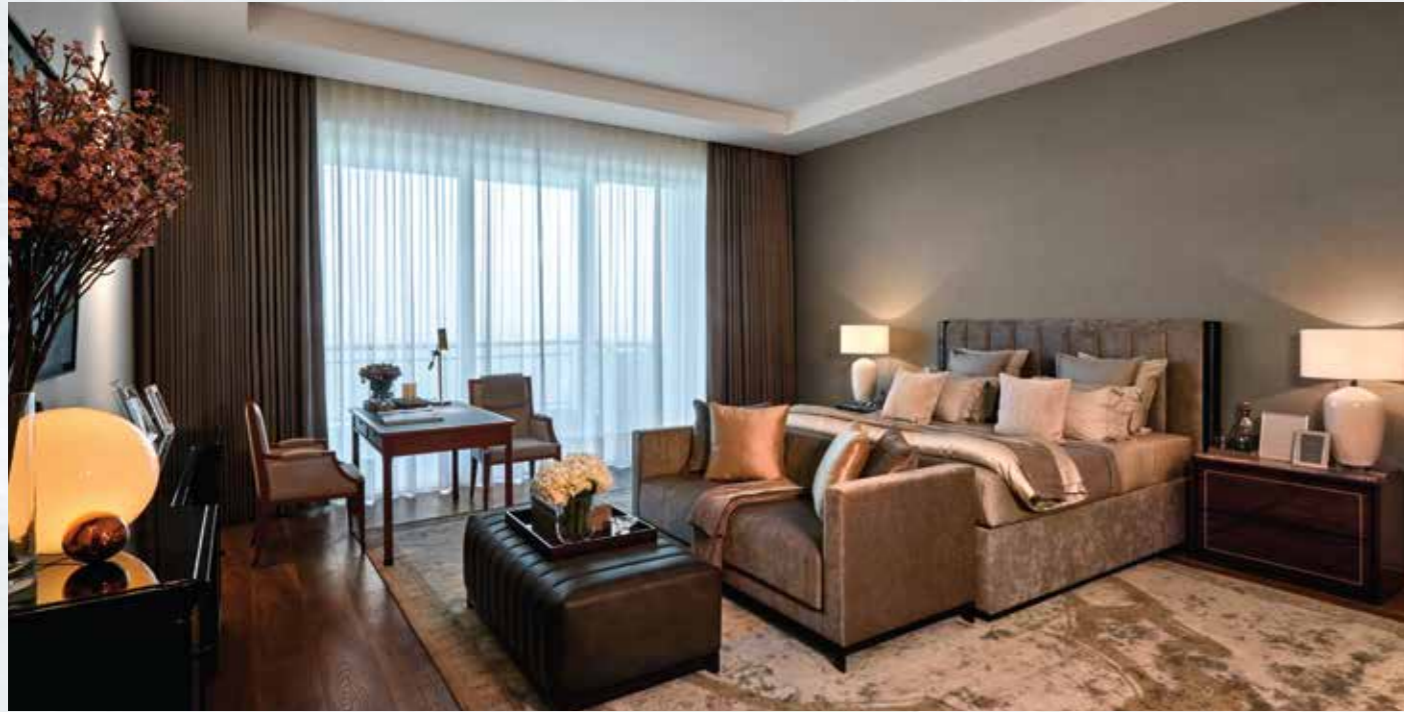
MASTER BEDROOM SUITE