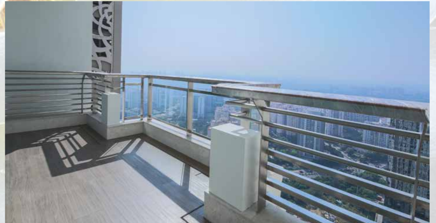
BEDROOMS 3 AND 4 DECK