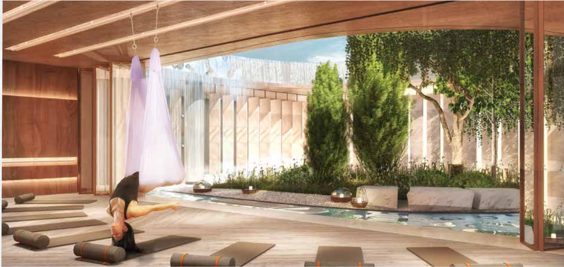
ARTISTIC RENDITION OF THE YOGA STUDIO