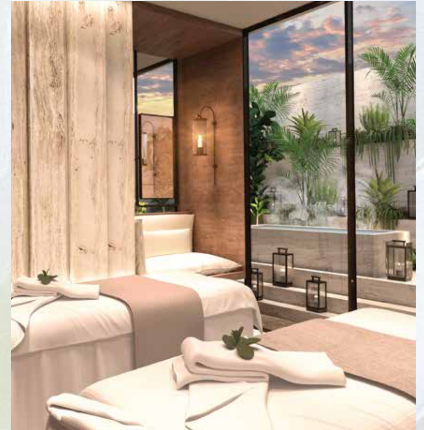
ARTISTIC RENDITION OF THE SPA