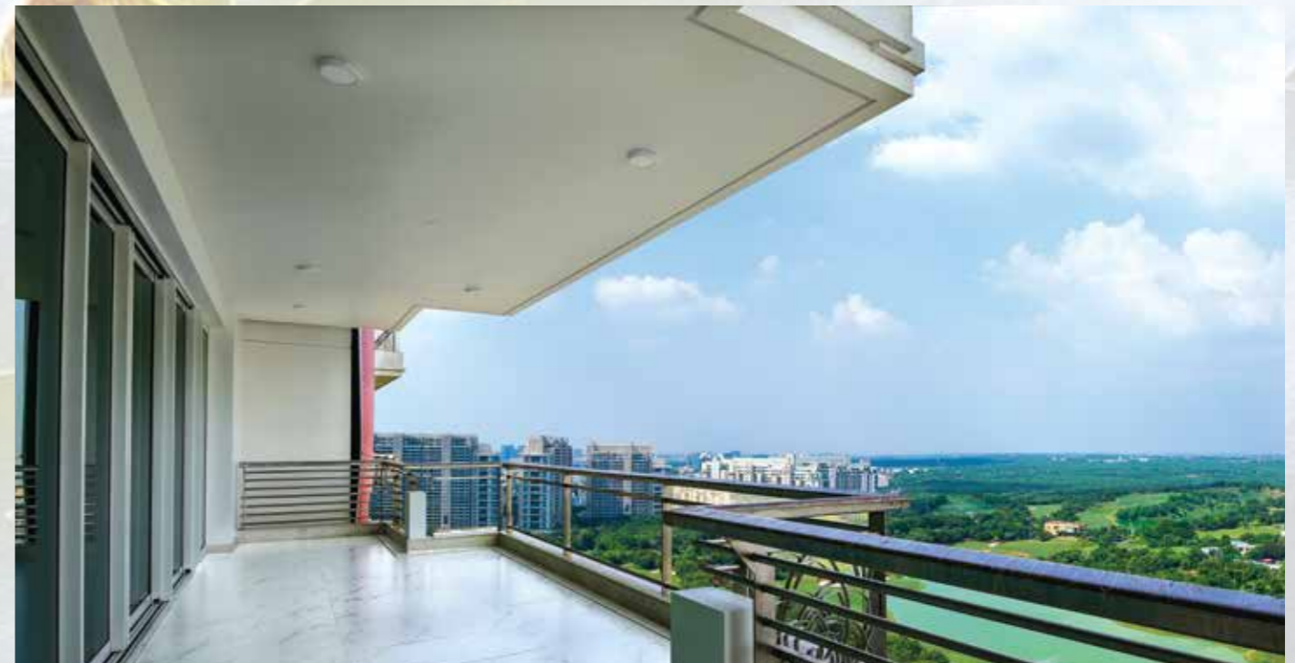
LIVING ROOM DECK