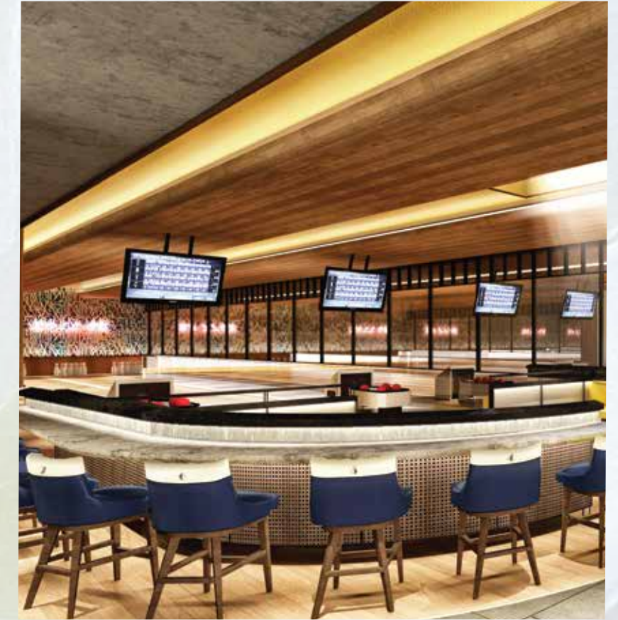
ARTISTIC RENDITION OF THE BOWLING ALLEY