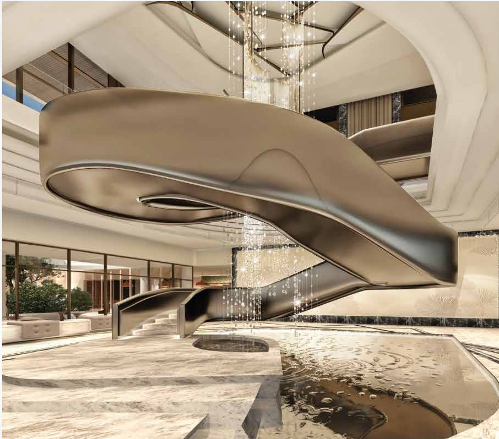
ARTISTIC RENDITION OF THE LOWER GROUND FLOOR LOBBY