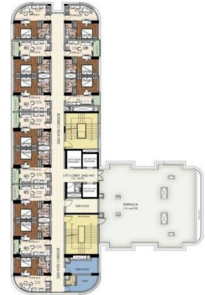
ELEVENTH TO TYPICAL FLOOR