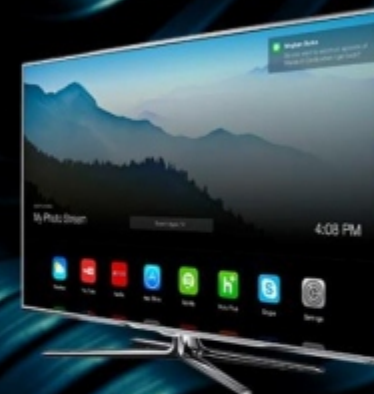
SMART TV (55 INCH)