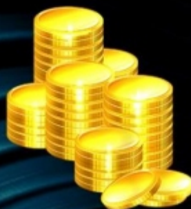
GOLD COIN 10 GM