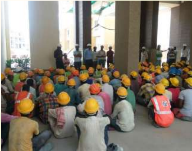
Periodic Mass tool box talk