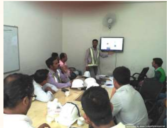
RSP training / Technical and Rescue training / Emergency