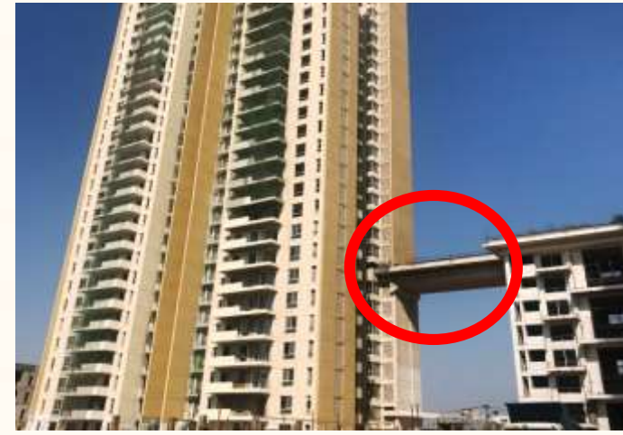
Skywalk between T7 – S10 completed