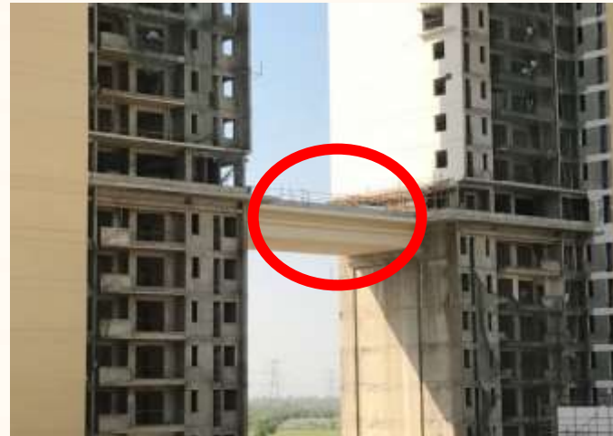
Skywalk between T4 & T5 completed

✓ Structure completed for all 3 skywalks