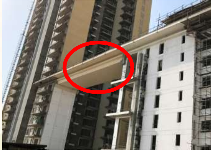
Skywalk between T3 –S5 completed