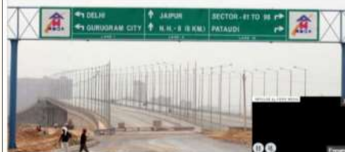
Work on Dwarka Expressway Gains Pace

DIAL 9555 248 188 TO INSTALL HANS@INDIA MOBILE APP