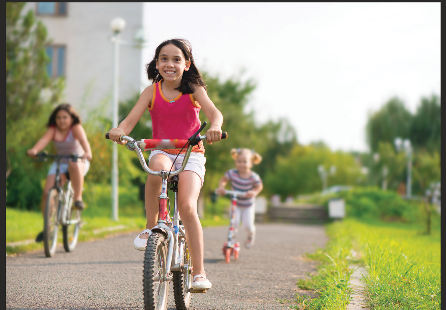
This image is for representative purpose only.