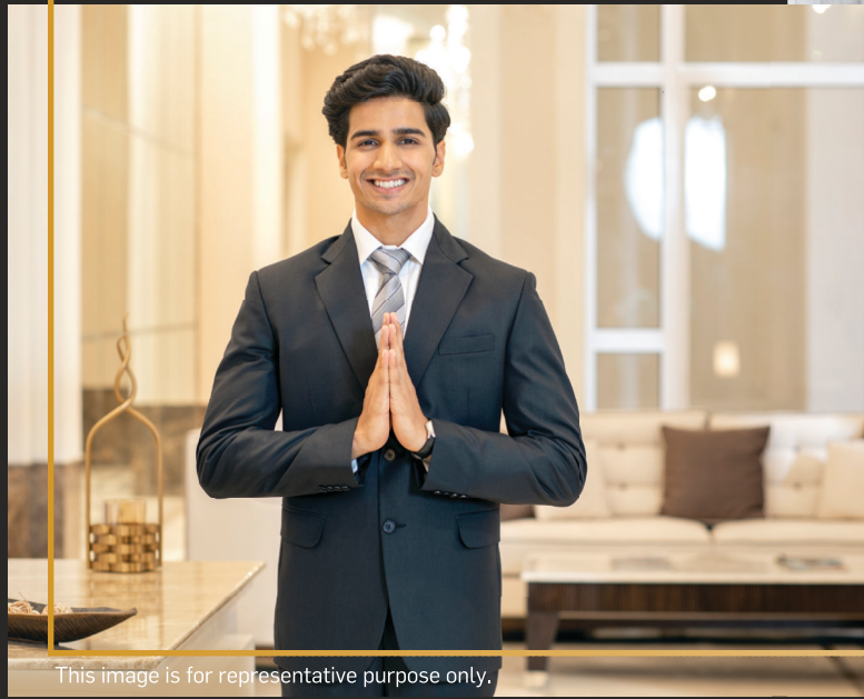
This image is for representative purpose only.