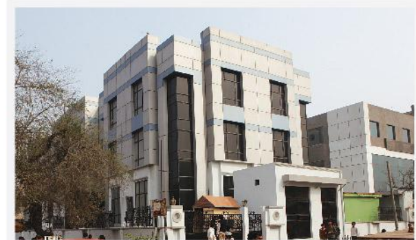
B-60, OKHLA PHASE-I