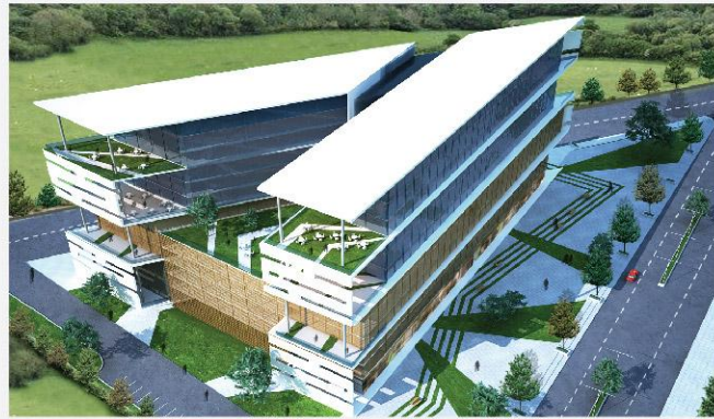
BYRON Sector 62, Golf Course Ext. Road, Gurgaon