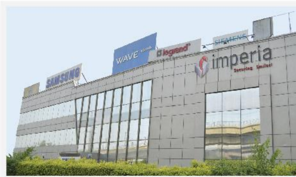
A-25, MATHURA ROAD