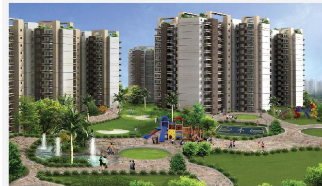
THE ESFERA Sector 37 C, Gurgaon-Dwarka Expressway