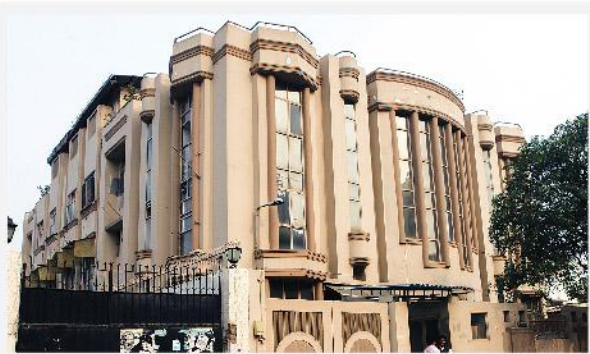
A-1/1, OKHLA PHASE-I