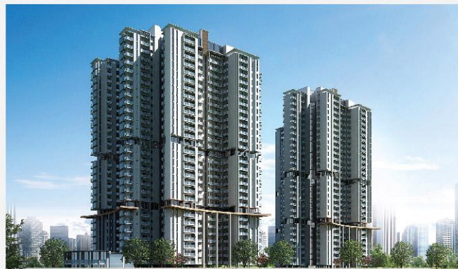
MIRAGE Homes at Sports City, Yamuna Expressway