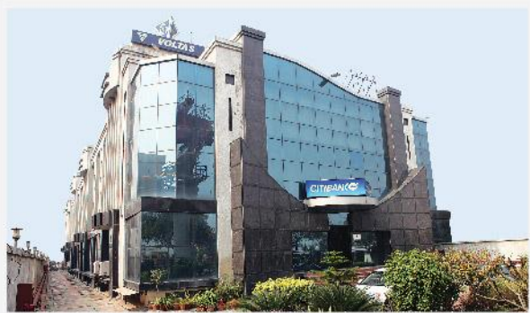
A-43, MATHURA ROAD