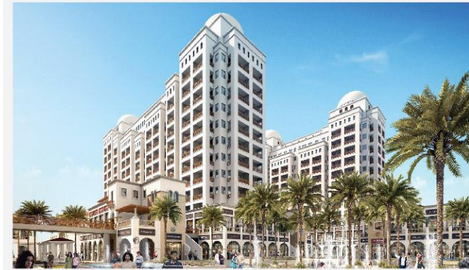
ELVEDOR Commercial Development at Sec 37 C, Gurgaon