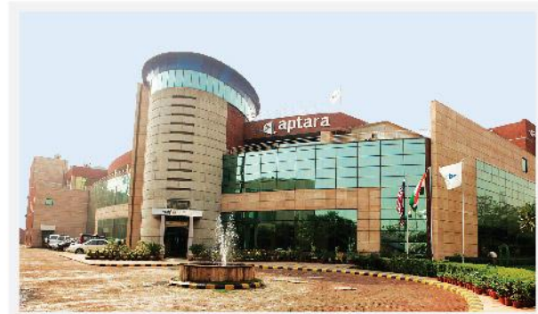
A-28, MATHURA ROAD