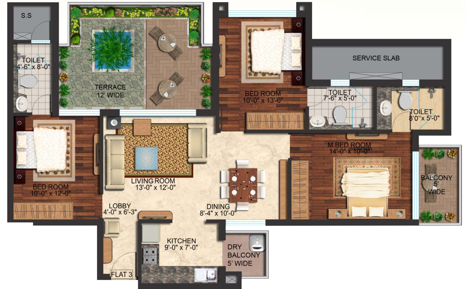
Super Area - 1620 sq. ft. 3BHK + 3T + TERRACE