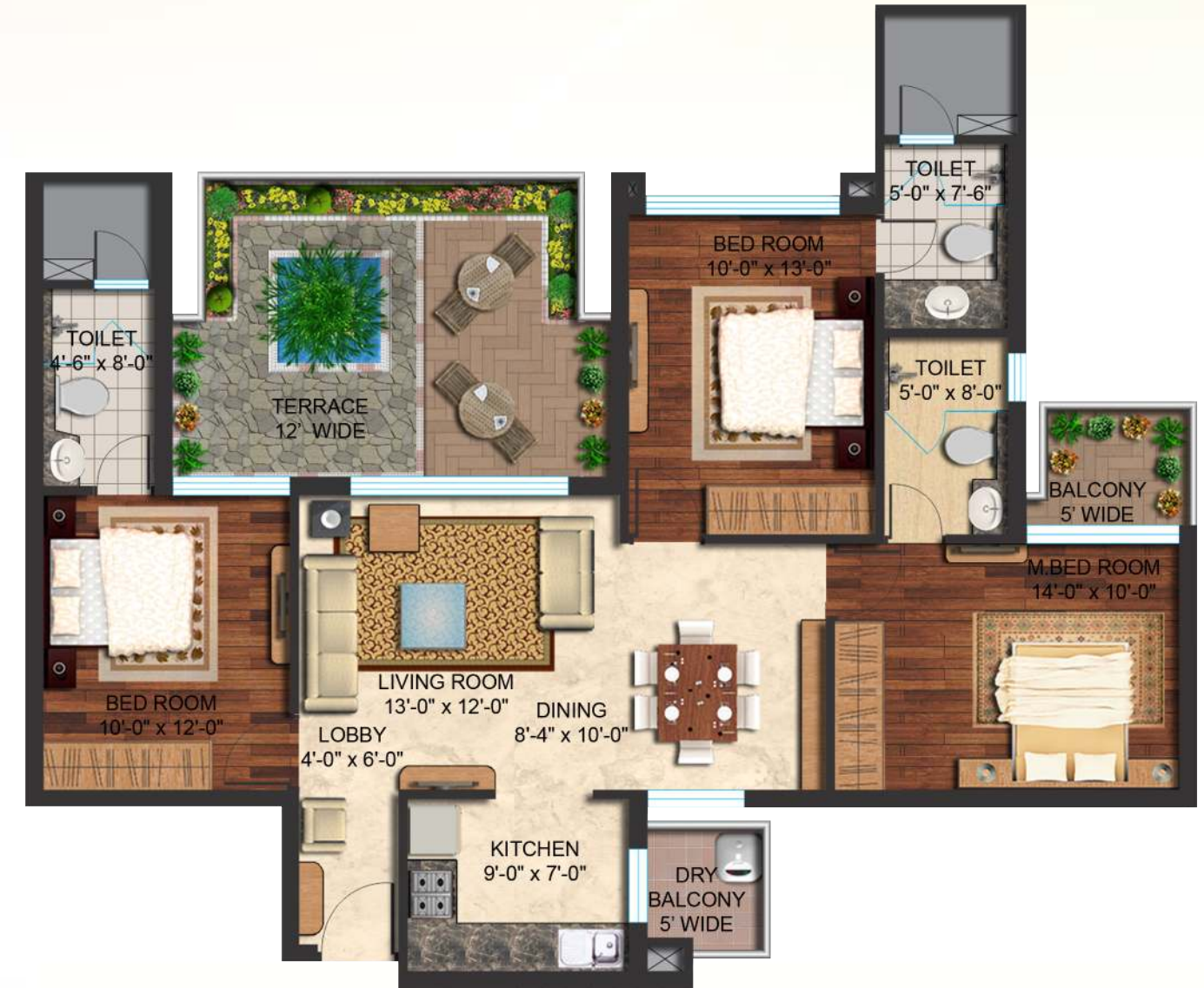
Super Area - 1620 sq. ft. 3BHK + 3T + TERRACE