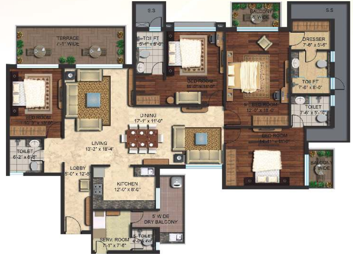
Super Area - 2710 sq. ft. 4BHK + 4T + SR + TERRACE

Disclaimer: In the interest of project, floor plans, layout plans, areas, dimensions and specifications are indicative and may change as decided by the company or by the competent authority.