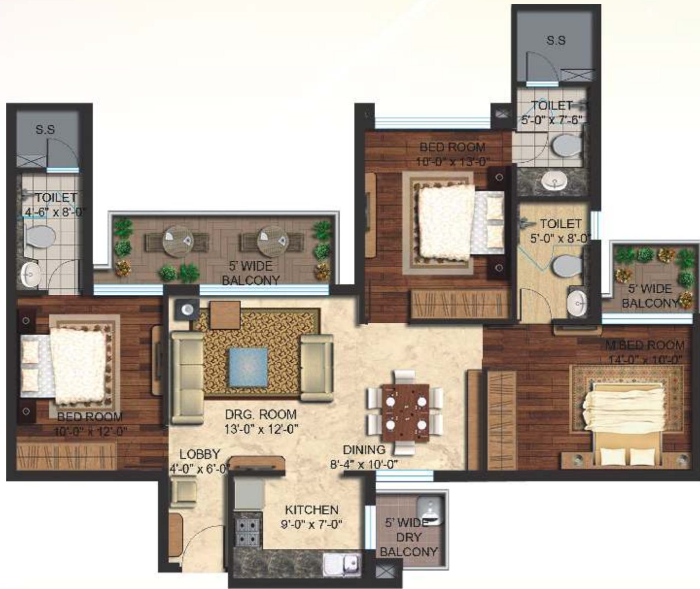
Super Area - 1490 sq. ft. 3BHK + 3T