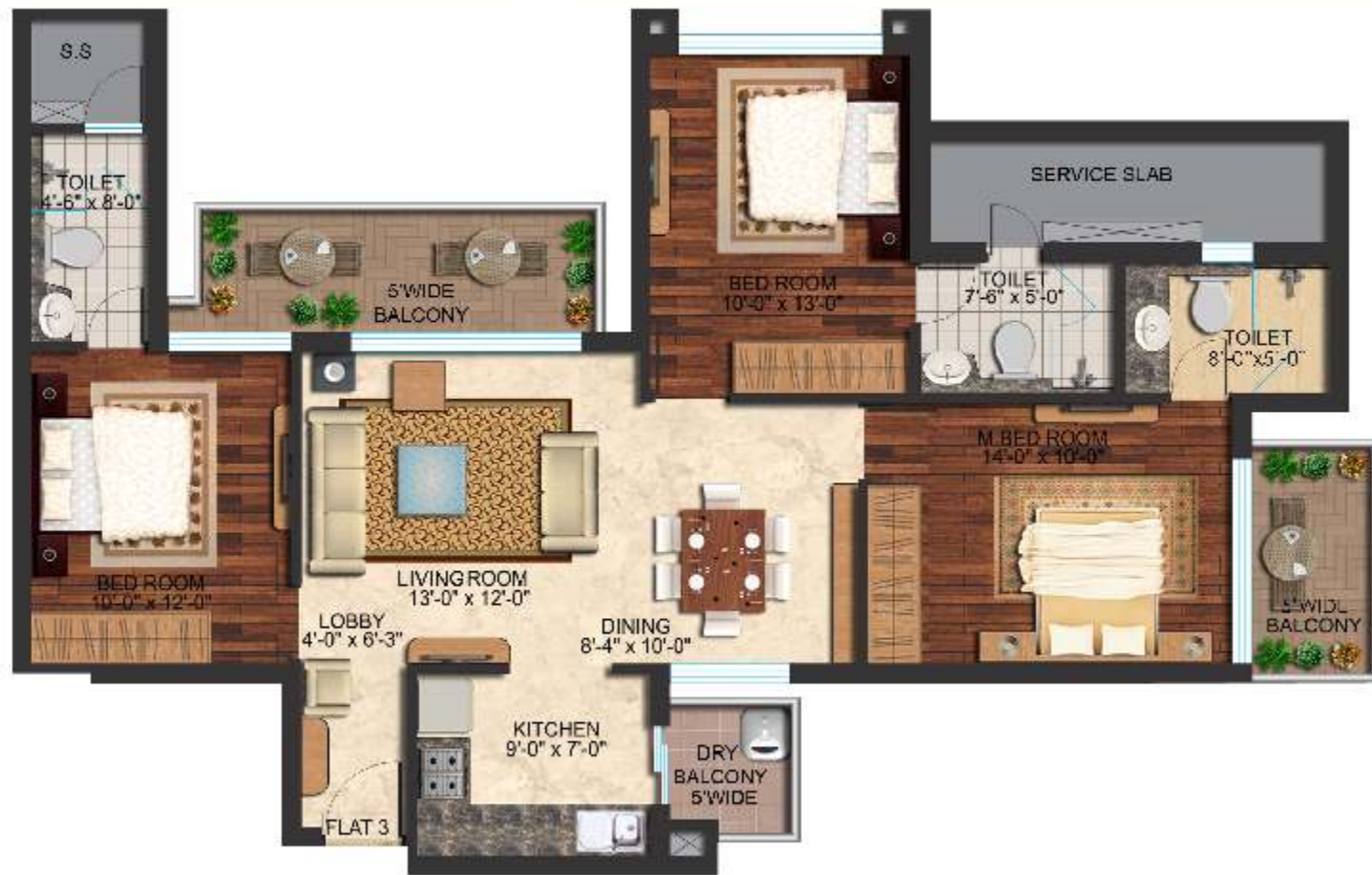
Super Area - 1510 sq. ft. 3BHK + 3T