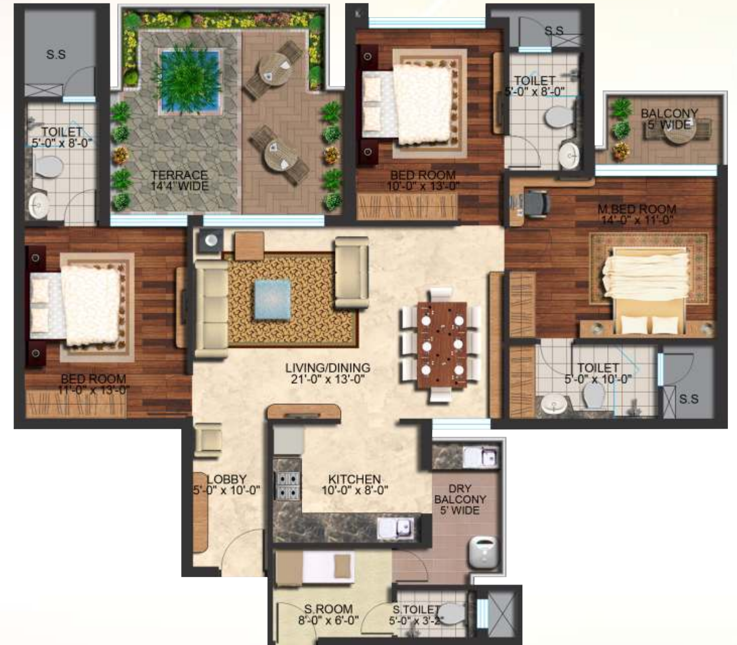
Super Area - 1960 sq. ft. 3BHK + 3T + SR + TERRACE

Disclaimer: In the interest of project, floor plans, layout plans, areas, dimensions and specifications are indicative and may change as decided by the company or by the competent authority.