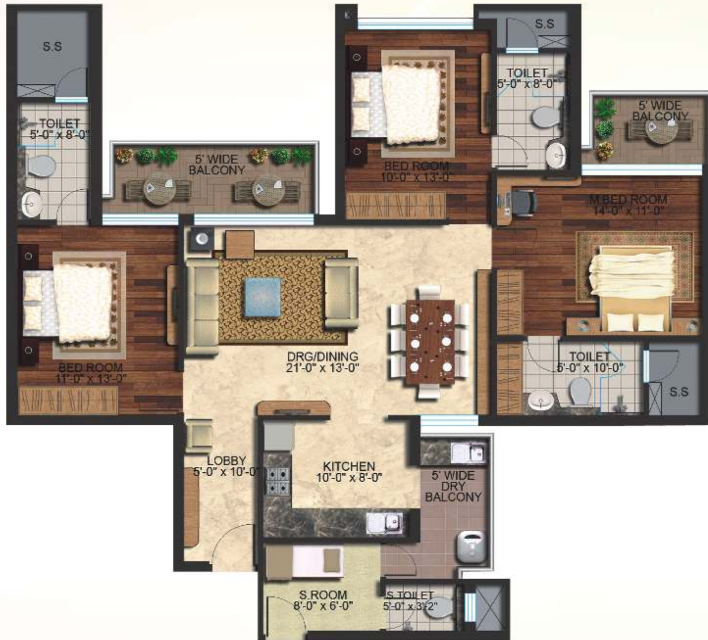
Super Area - 1815 sq. ft. 3BHK + 3T + SR

Disclaimer: In the interest of project, floor plans, layout plans, areas, dimensions and specifications are indicative and may change as decided by the company or by the competent authority.