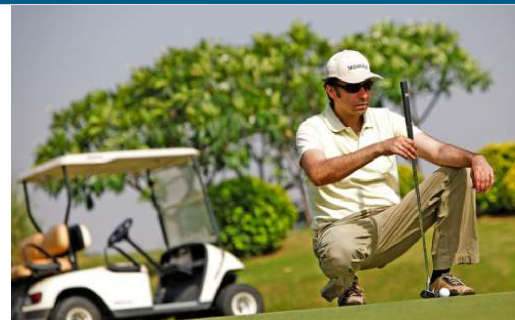
Chart on a course that sets your pulse racing.