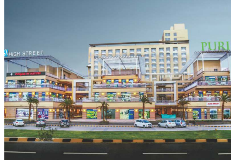
81 High Street, Sector - 81, Faridabad