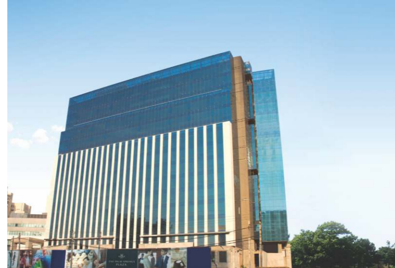
Palm Spring Plaza, Sector - 54, Gurugram