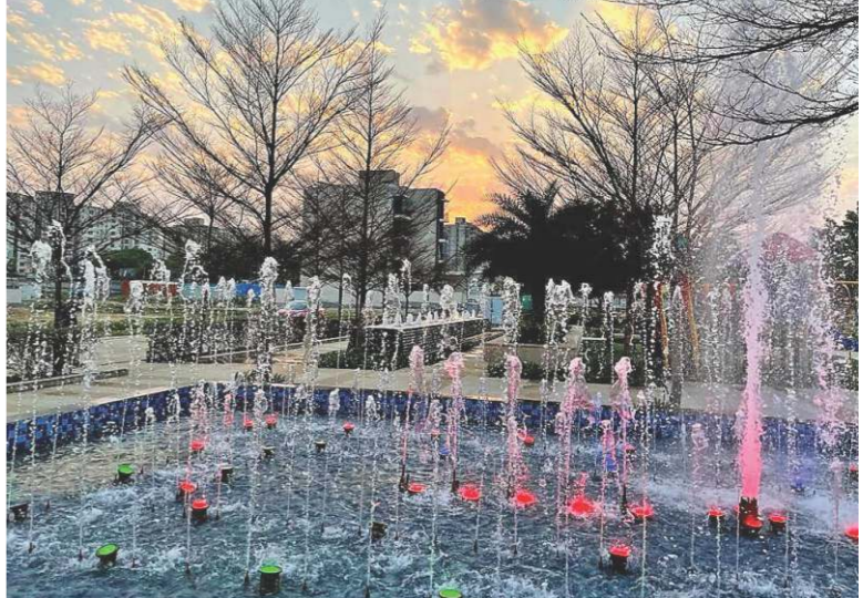
Amanvilas, Sector - 89, Faridabad