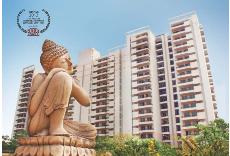
The Pranayam, Sector - 82-85, Faridabad