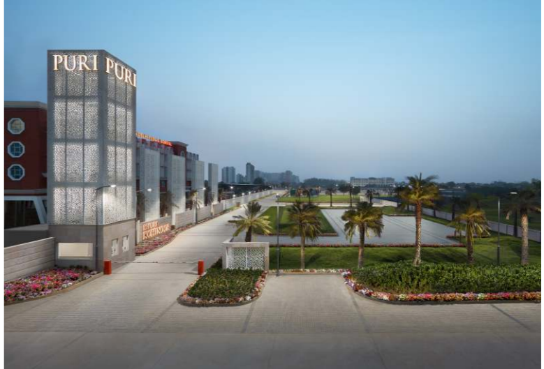
Kohinoor, Sector - 89, Faridabad