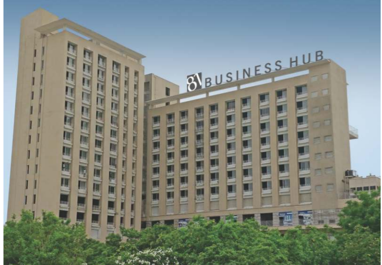
Business Hub, Sector - 81, Faridabad