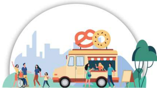
FOOD TRUCK ZONE