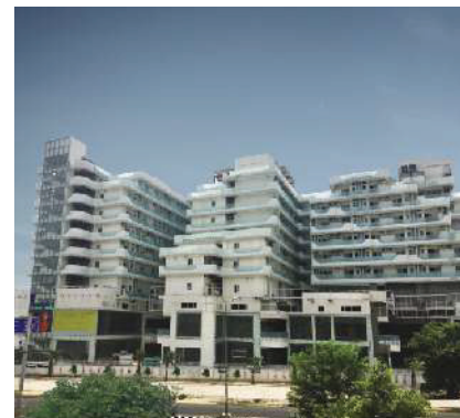
ELEMENT ONE, GURUGRAM High Street Retail and Fully Furnished Serviced Apartments