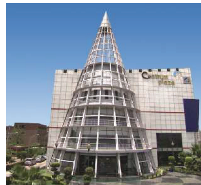
CENTRUM PLAZA, GURUGRAM Premium Office Complex, Sector 53, Golf Course Road