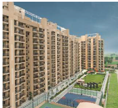
THE HERMITAGE, GURUGRAM Group Housing Development, Sector 103