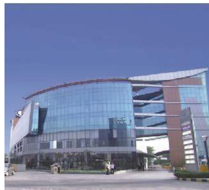
THE GALAXY, GURUGRAM 5-Star Hotel-Shopping-Spa