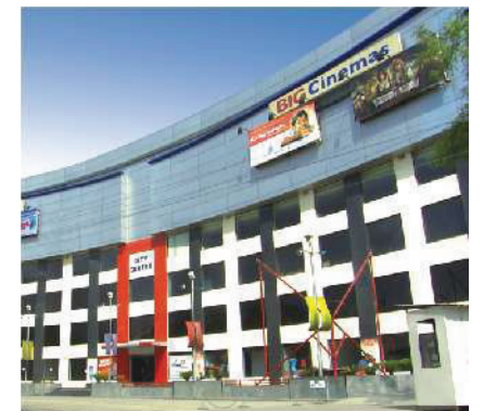
CITY CENTRE, BATHINDA (Pb) Shopping cum Entertainment Centre, Mini Secretariat