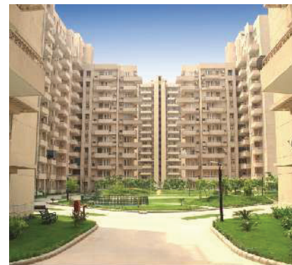
THE LEGEND, GURUGRAM Luxury Residences, Sector 57