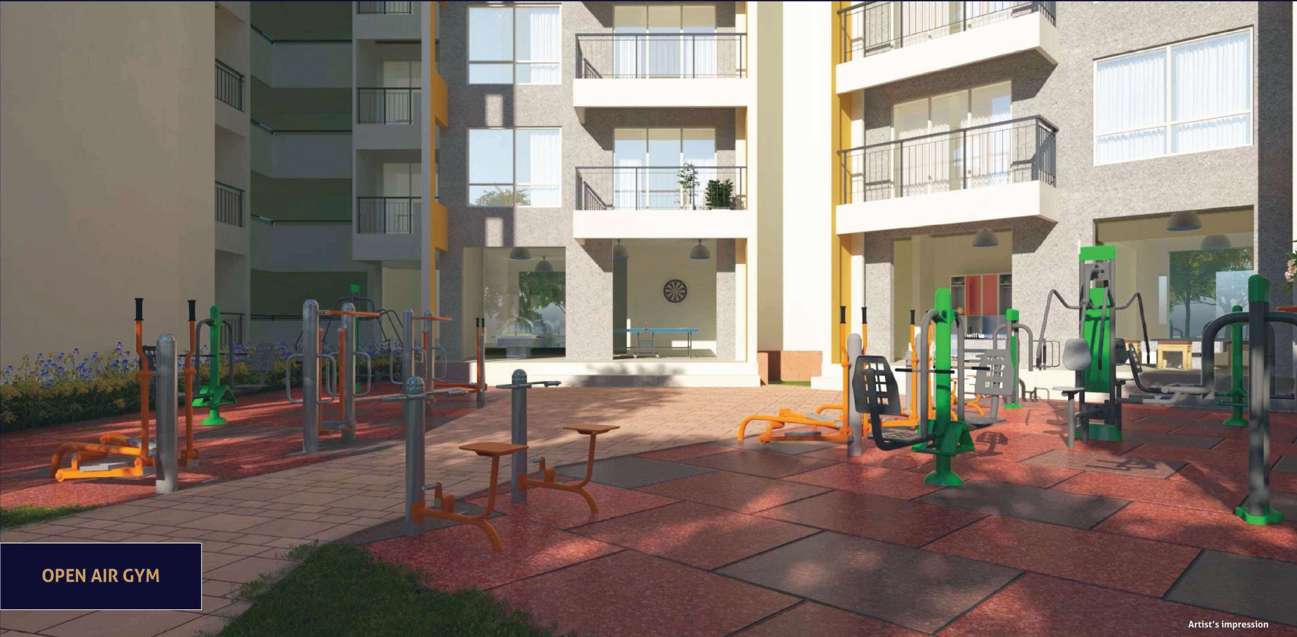
OPEN AIR GYM

Sweat it out under the open sky. Your daily dose of natural vitamin D is out here.