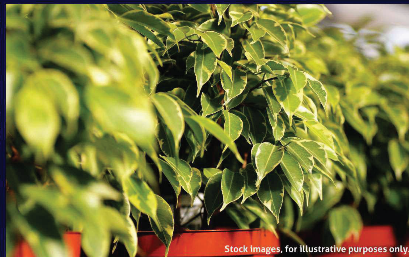
Stock images, for illustrative purposes only.