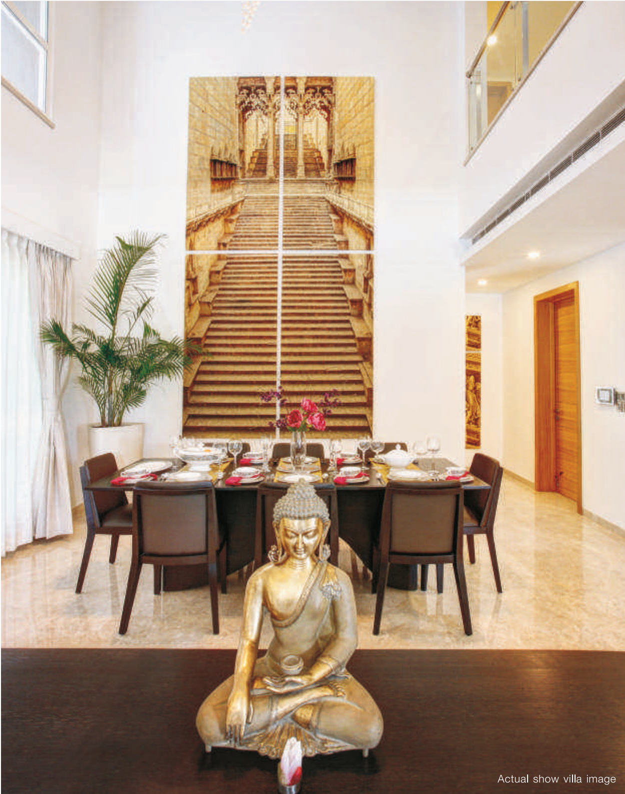
Actual show villa image

presidential villas | international city