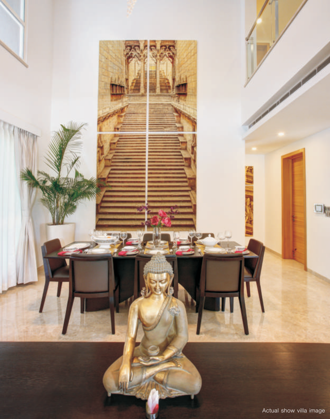
Actual show villa image

presidential villas | international city