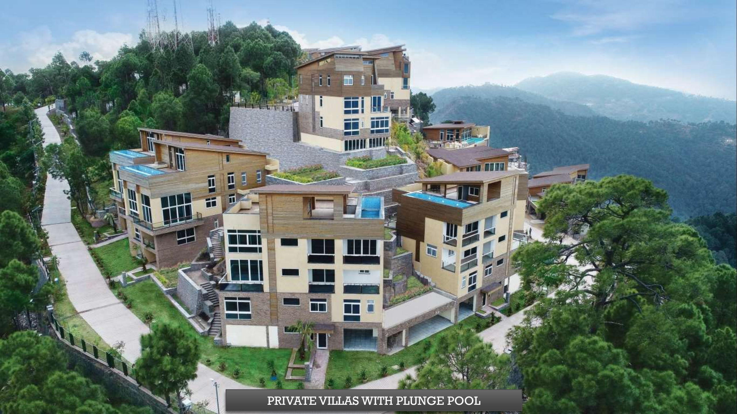
PRIVATE VILLAS WITH PLUNGE POOL