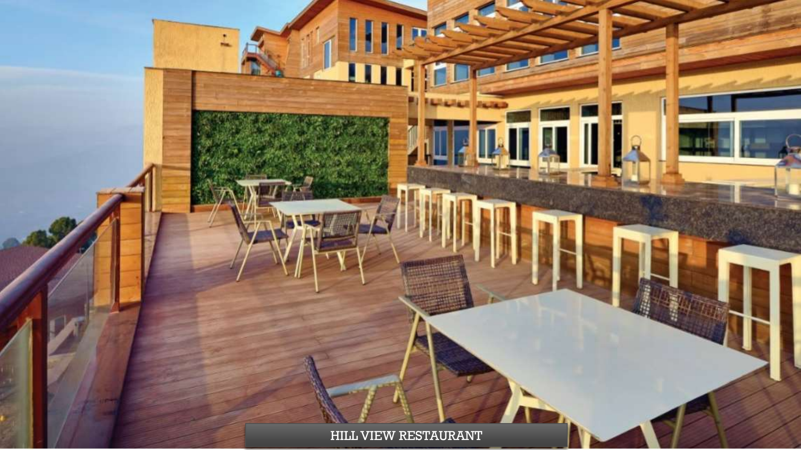
HILL VIEW RESTAURANT