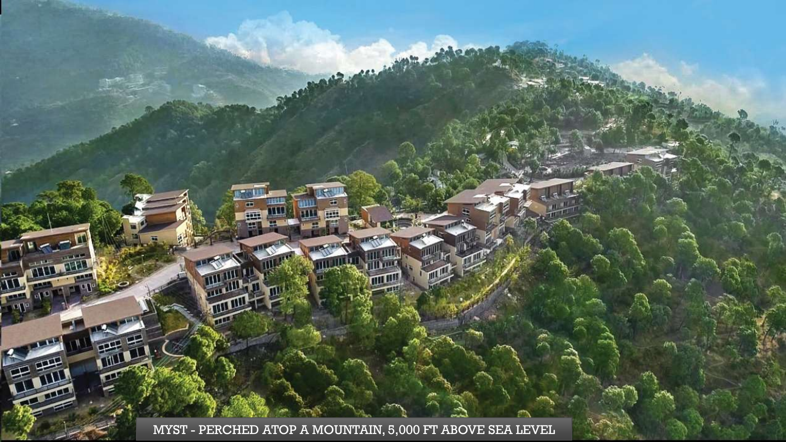
MYST - PERCHED ATOP A MOUNTAIN, 5,000 FT ABOVE SEA LEVEL