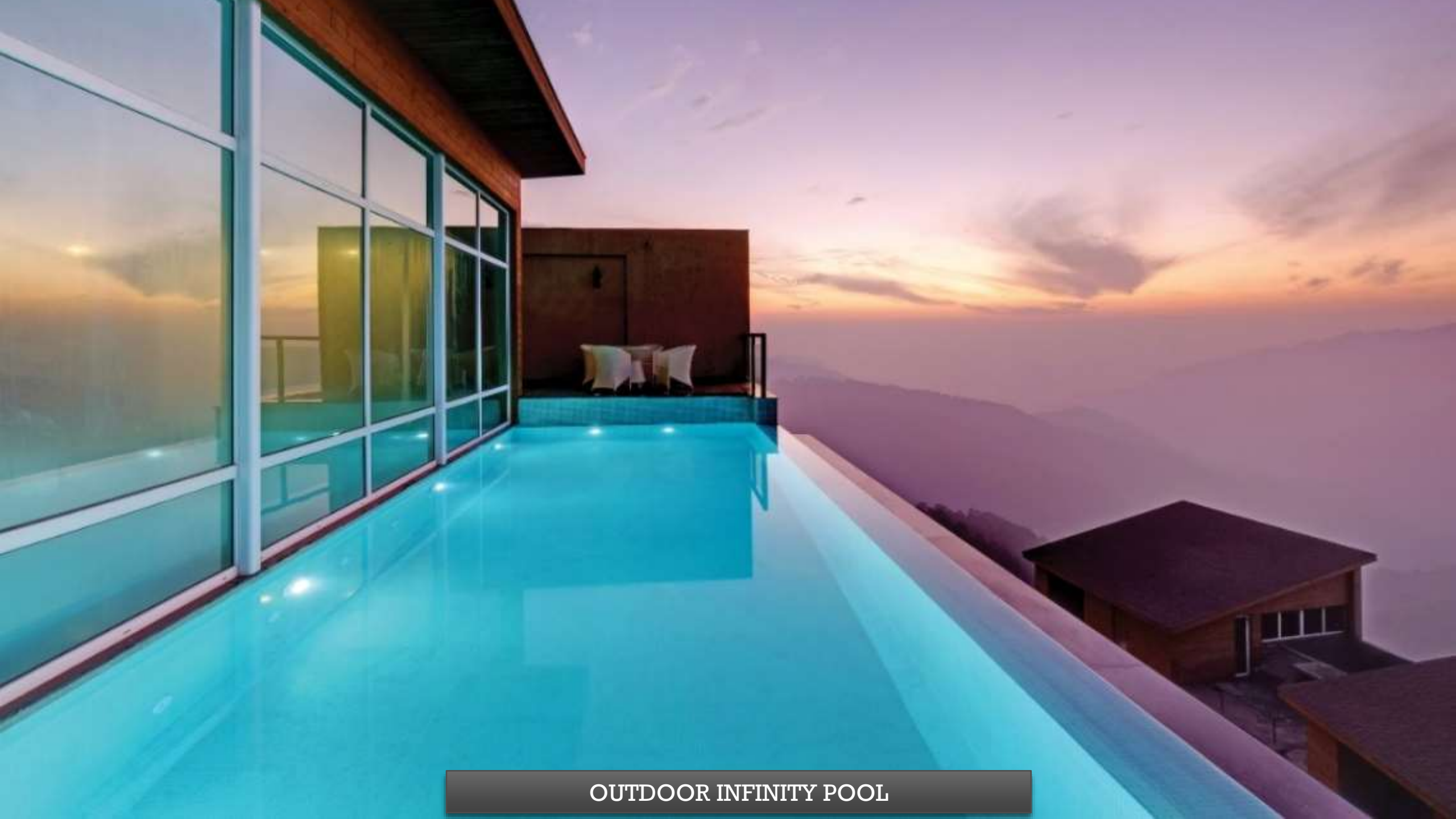
OUTDOOR INFINITY POOL