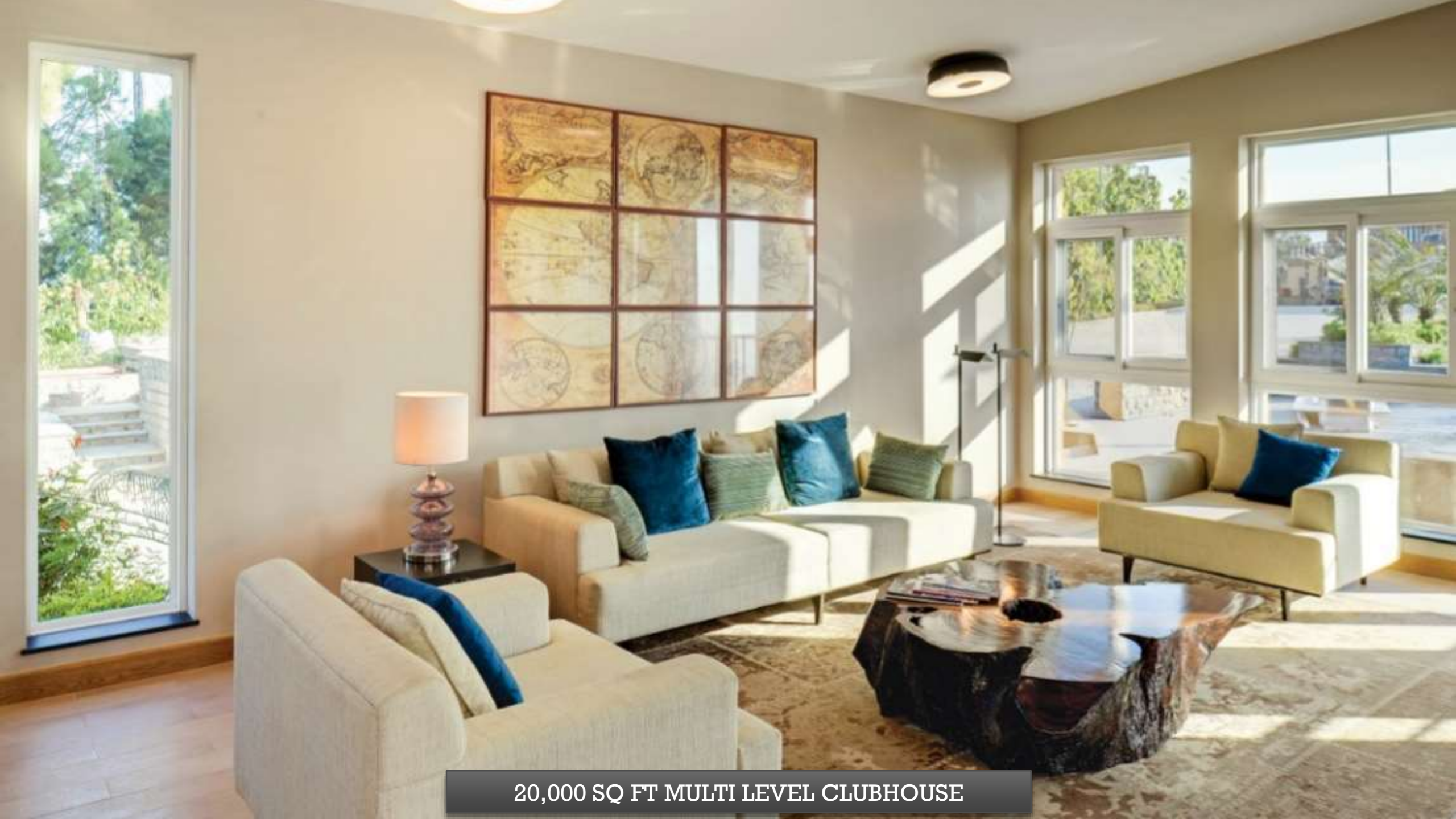
20,000 SQ FT MULTI LEVEL CLUBHOUSE