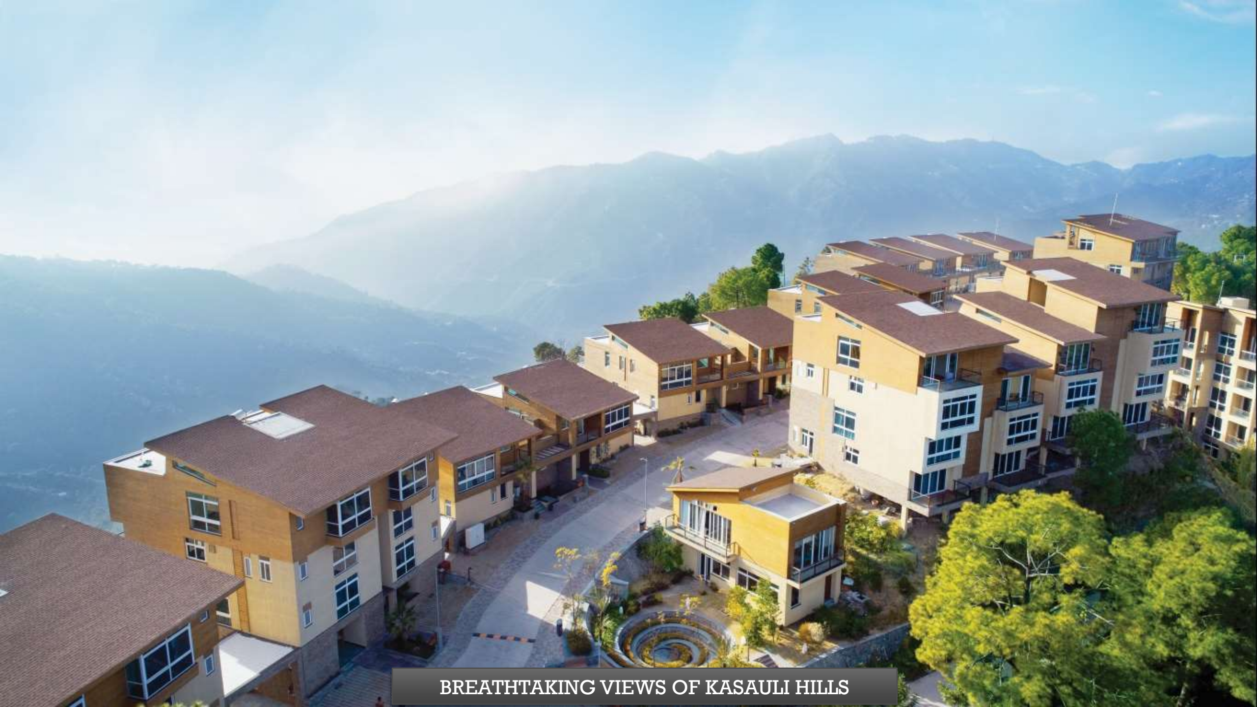
BREATHTAKING VIEWS OF KASALI HILLS