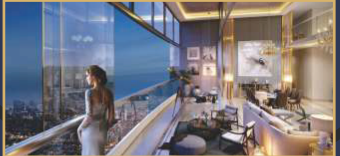
Views of Rashtrapati Bhawan, Connaught Place, Parliament House could be seen from top/upper floors