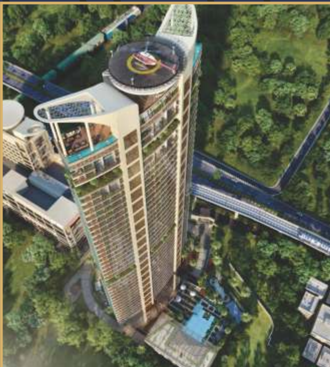
Tallest planned Tower of New Delhi