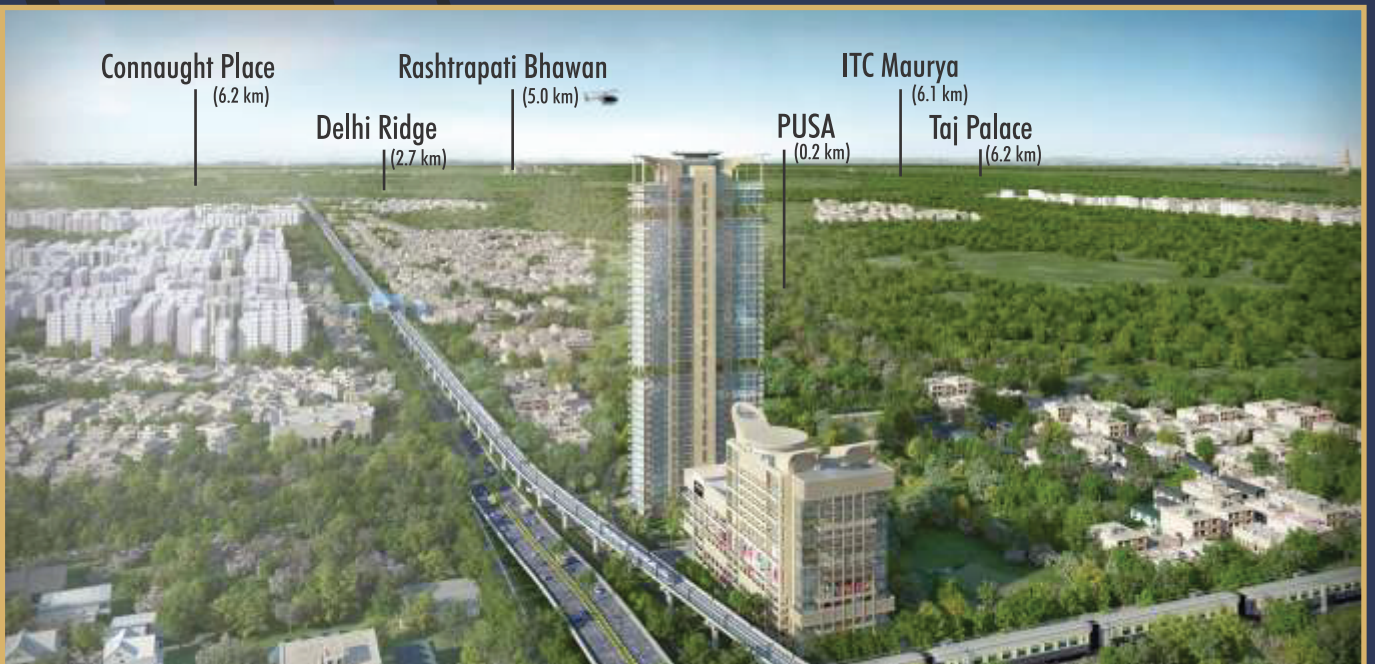
Overlooking PUSA Greens, Delhi Ridge, Lutyen's Bungalow Zone and other Landmarks of Delhi All the above mentioned kms are aerial distances