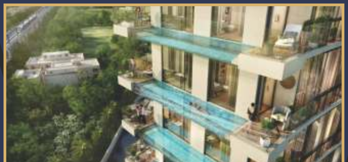
Every 4,5 BHK comes with its private Lap Pool