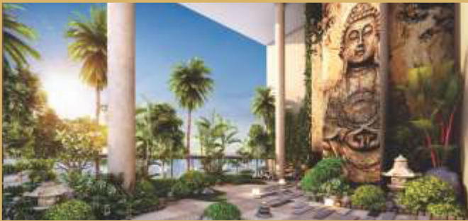
The gardens at The Sky-lounge - Double the height, double the fun!