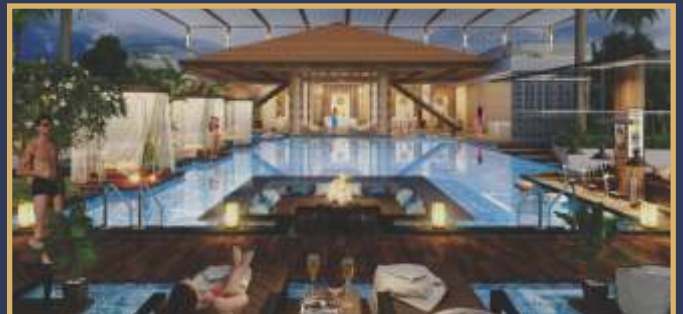
Pina-coladas and Caprioskas, all would be served chilled at the poolside