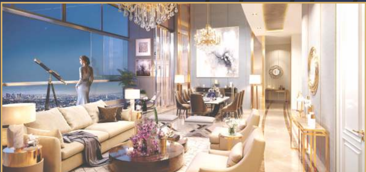
One of the Highest Ceiling Heights in India, Optional Hotel Style Interiors