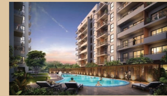
FAR LEFT Sovereign Park – The perfect balance of Luxury and Leisure