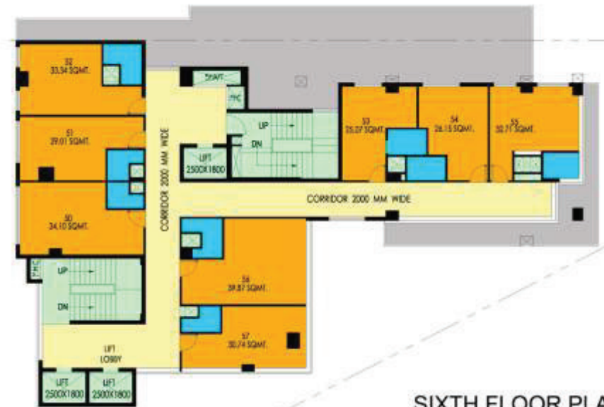
SIXTH FLOOR PLAN