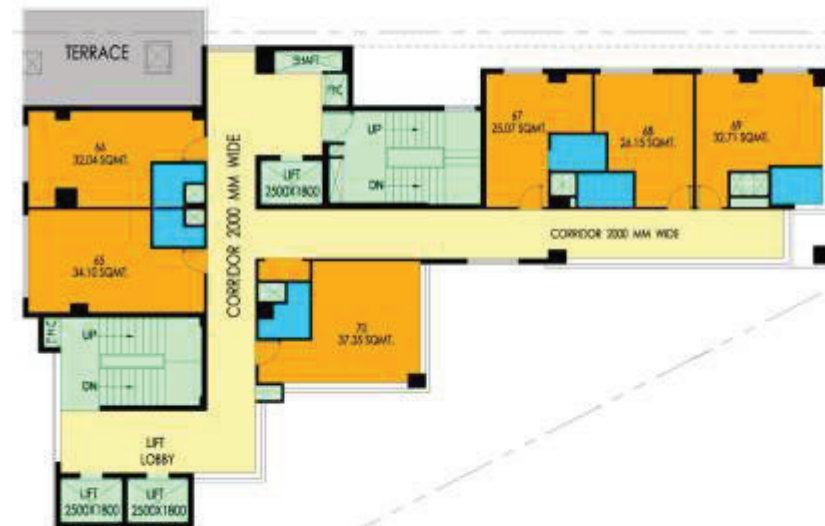
EIGHTH FLOOR PLAN