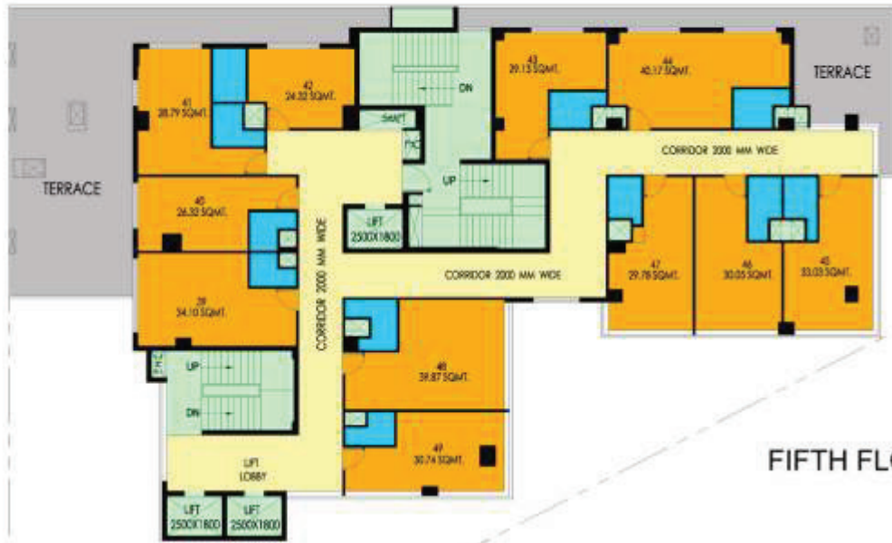
FIFTH FLOOR PLAN