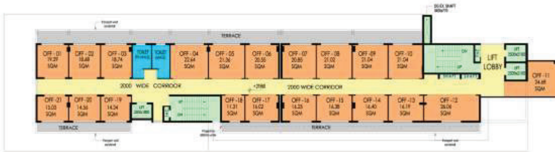
FIFTH FLOOR PLAN