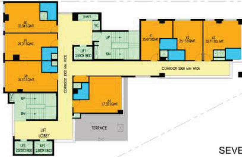
SEVENTH FLOOR PLAN