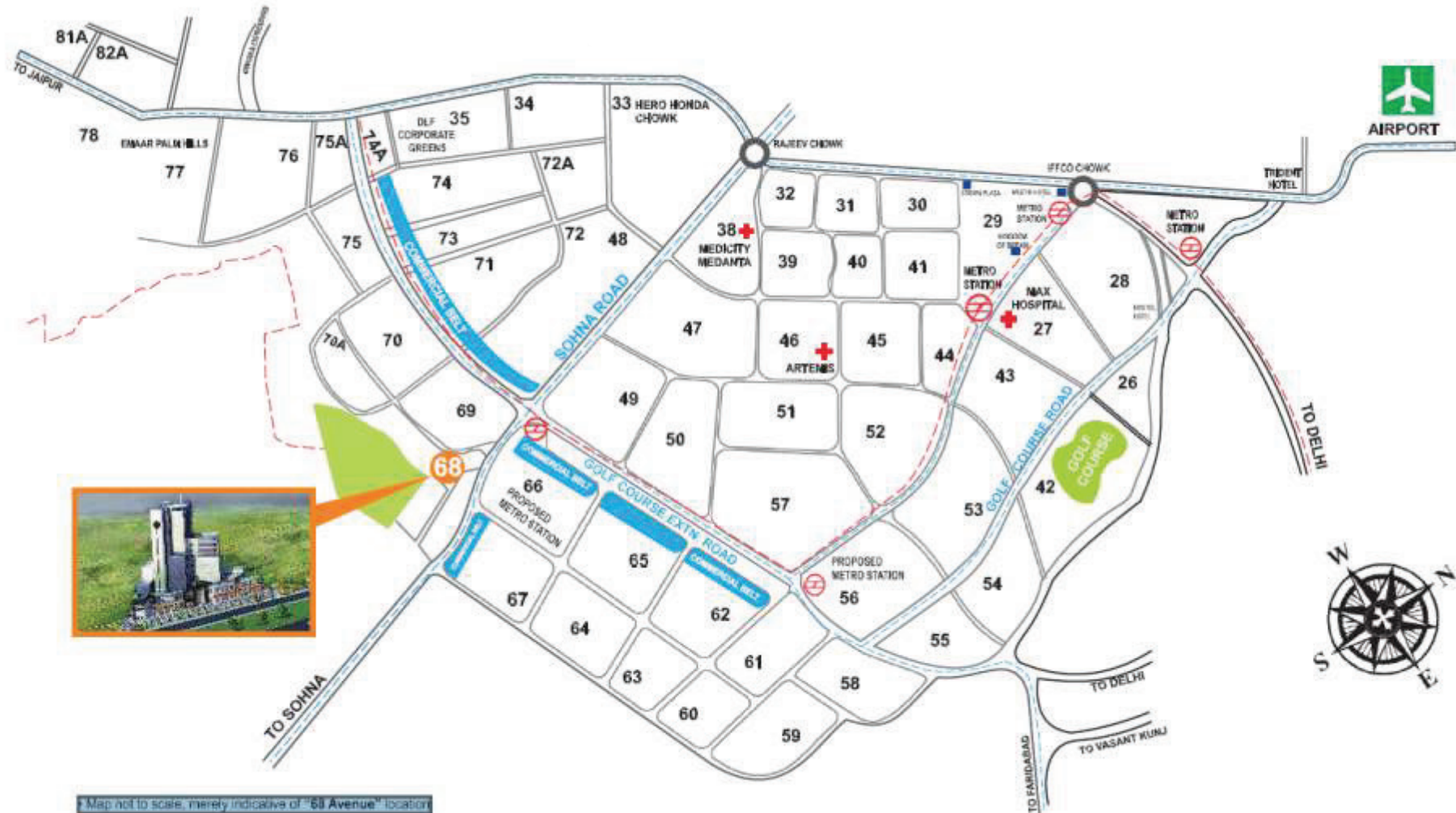
Map not to scale, merely indicative of "68 Avenue" location